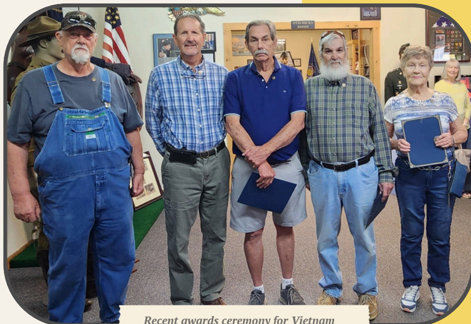
Recent awards ceremony for Vietnam Veterans with Church members