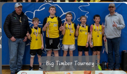
Big Timber Tourney