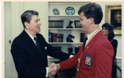
Top: Ronald Reagan Bottom: Gerald Ford