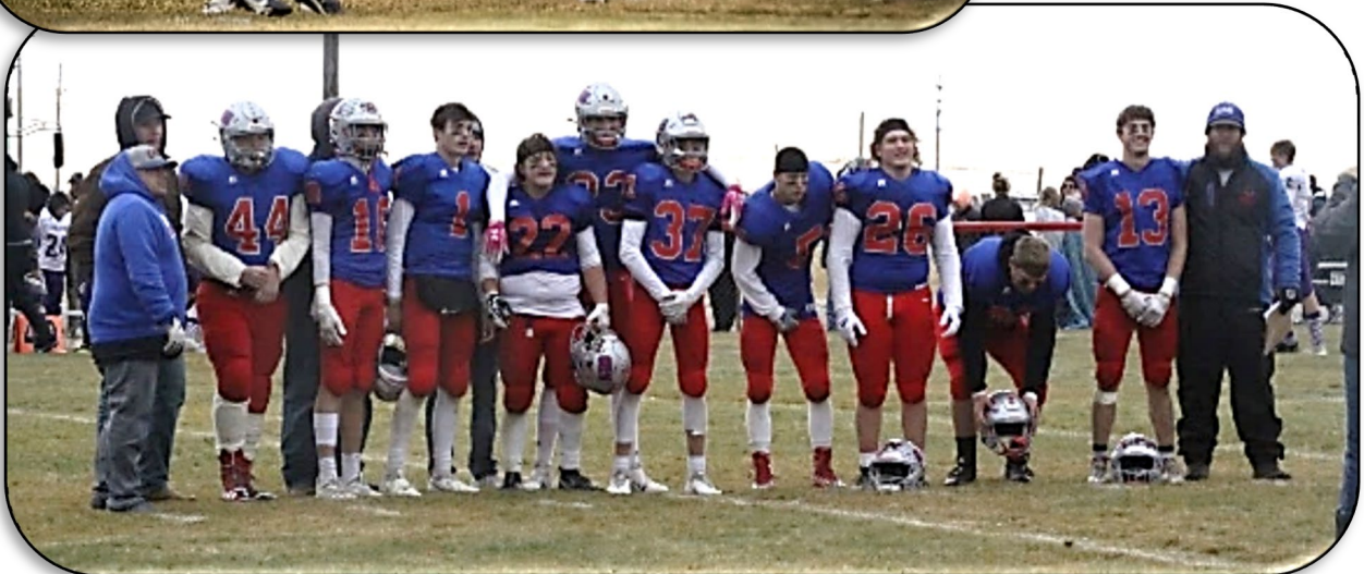
DGS-GRW vs. Broadview-Lavina, 1st Round 6-Man football playoff.