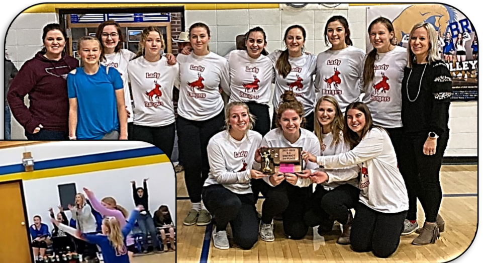
Above: GRW Rangers with their 3 rd Place trophy at the District Tournament in Melstone.