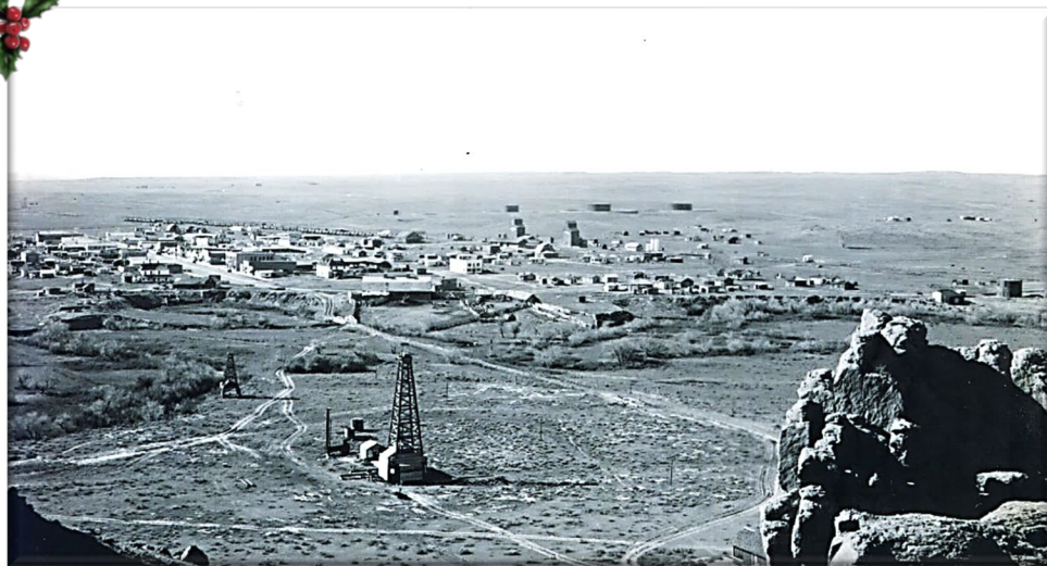
View of Winnett from the rimrocks in 1924.