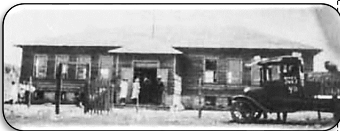
Lepper Memorial Hall 2021.