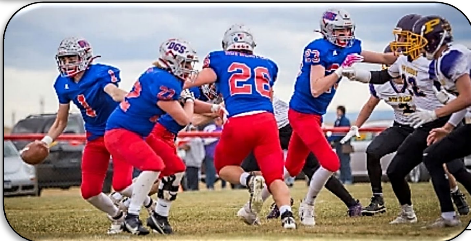
DGS-GRW vs. Big Sandy 2nd Round Playoffs