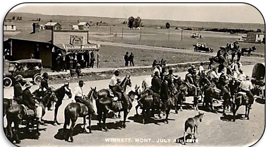
July 4, 2016: East end of Main Street near corner of Lepper and Main before construction of the Winnett Block (present courthouse).

In the future there will be a county division meeting in the Lodge Hall every Monday evening at which time the progress of the previous week will be reported and plans outlined for the week to come. Citizens interested in the division of the county and have grown weary of bearing the highest taxation of any county in Montana will attend these meetings without any urging.