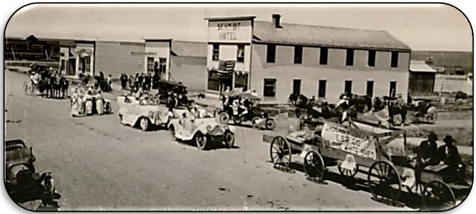
North side of Main Street July 1916 (L to R): Eager building under construction, Bachelor Cafe, Central Billiard Parlor, Montana Bar, Schmidt Hotel.

Those who have not already had their brands re-recorded should do so before January 1 st . After that date someone else may get the brand of some present owner with the result that it would be illegal for the former owner to continue to use it and making it necessary for him to get another brand. Brands are rerecorded by the Register of Brands, Helena, Montana. Have your brand recorded now.