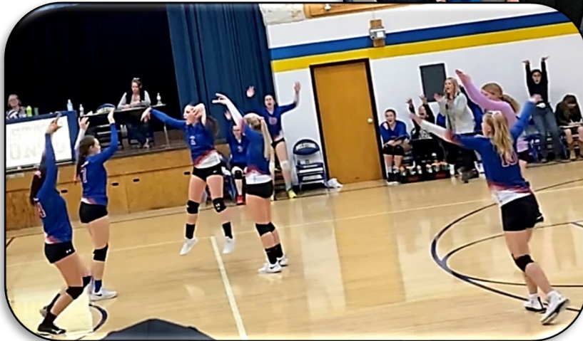
To Left: GRW Rangers celebrating after their victory over TCT at Districts securing their spot to the Divisional tournament.