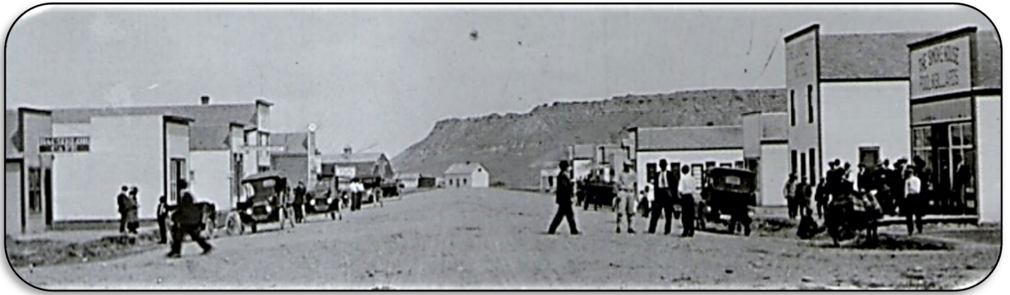
Looking east from Broadway on Main Street in 1916. North side (L to R): Bachelor Café, Central Billiard, Montana Bar, Schmidt Hotel, Mahon-Robinson, Winnett Land Co., Log Cabin Saloon; South side (L to R): Smokehouse, Jarrett Hotel, Toggery, Winnett State Bank, Woods Drugstore, Spears Restaurant in Moll building, Winnett Times, Langshausen Office, 1 st Enterprise Meat Market, The Mode Clothing, Rasmussen Mercantile, Post Office, Hoyle Barbershop.

authentic record of the progress of the city and the doings of its people. Winnett's history is not ancient. Ten years will carry you back beyond the memory of nearly the entire population. However, it is a history brim full of achievement, flowing over with progress with never a let up in its onward march toward its goal, the metropolis of central Montana.