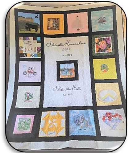
Homemakers quilt on display at the courthouse