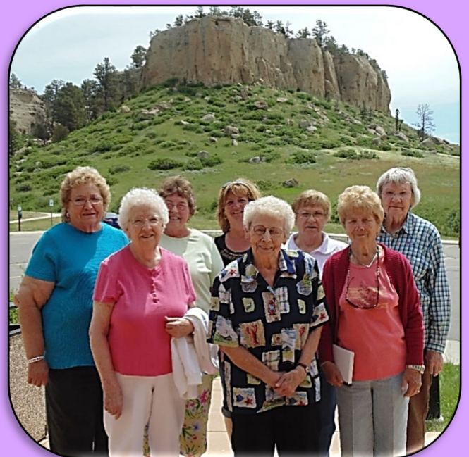
Homemakers at Indian Caves in June 2014