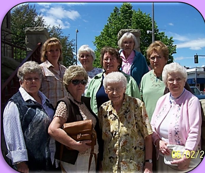
Flatwillow Homemakers at the Western Heritage Center