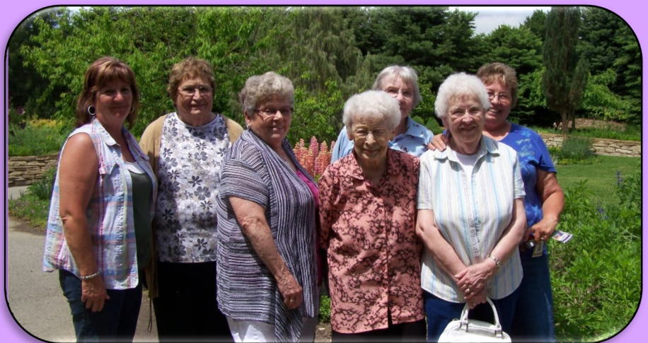
Flatwillow Homemakers at ZooMontana in June 2013