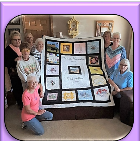
Flatwillow Homemakers and the quilt they all put together.