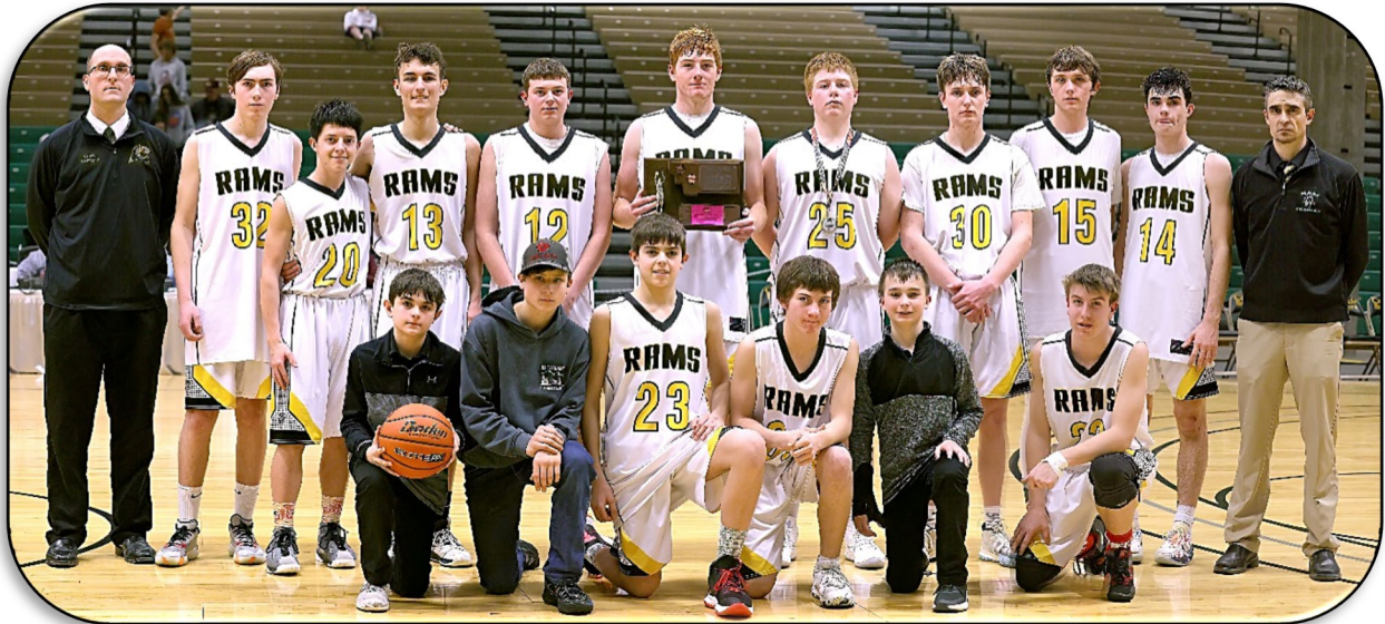
WGR Rams with their 3 rd Place Trophy at the Northern C Divisional Tournament